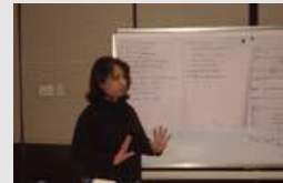
Attendees from 71 countries